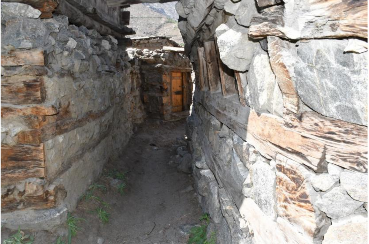
The entrance street towards the castle rock, thick and highly stable wooden wall structures