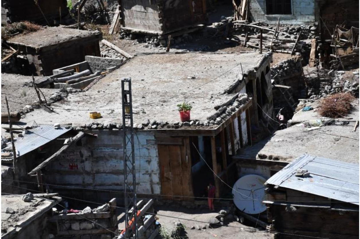
View of immediate neighbor houses from the top of the castle rock