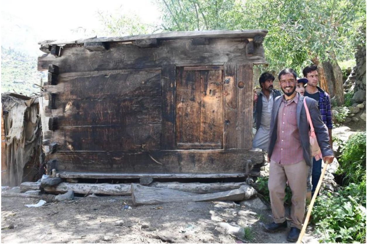
An old typical pure wooden hut, room of house like a cell with traditional lock system near the castle