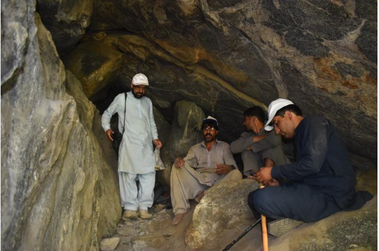
Experiencing cool wind at the entrance of the cave