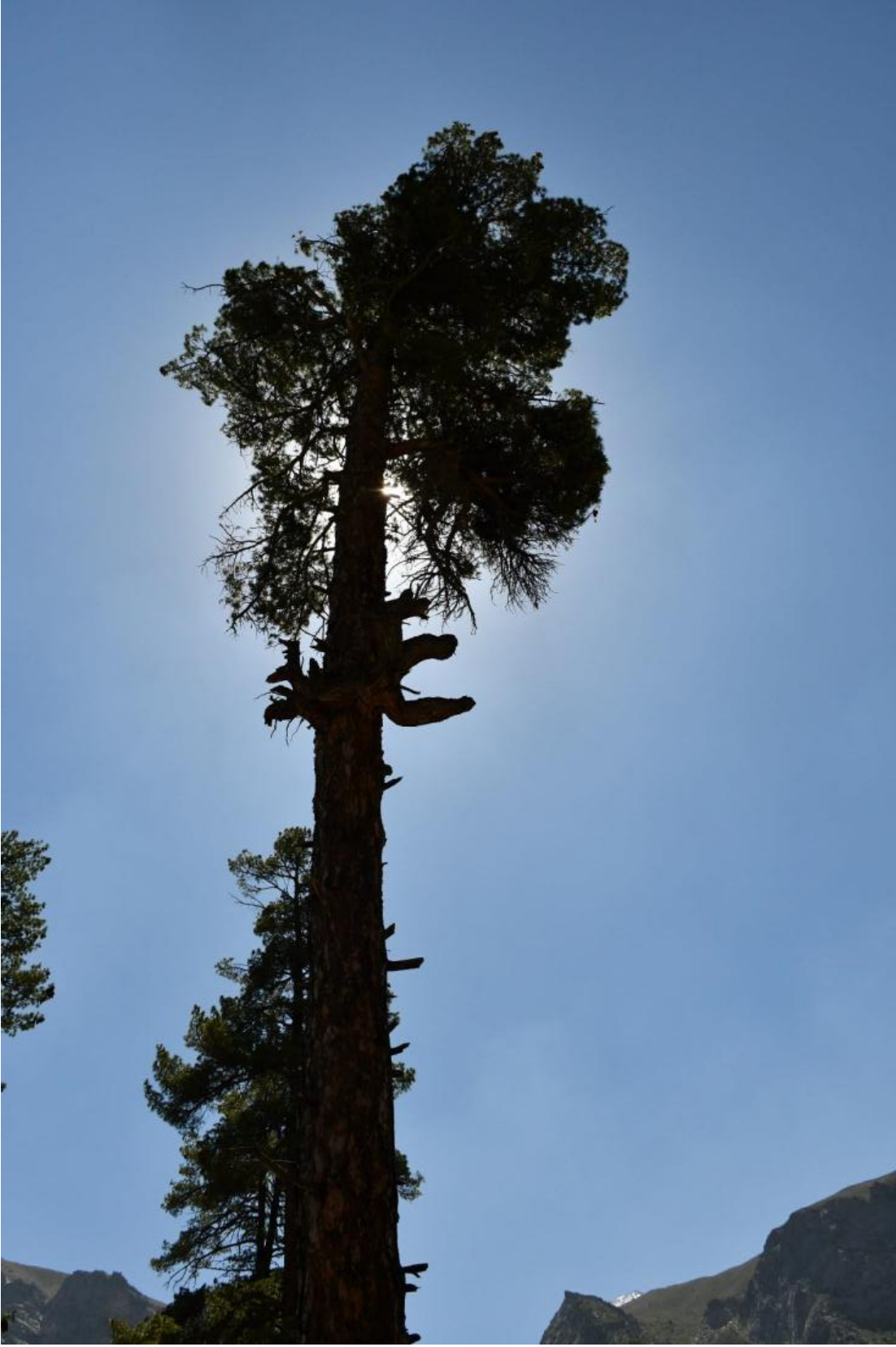
Old ever green trees of around 250 years