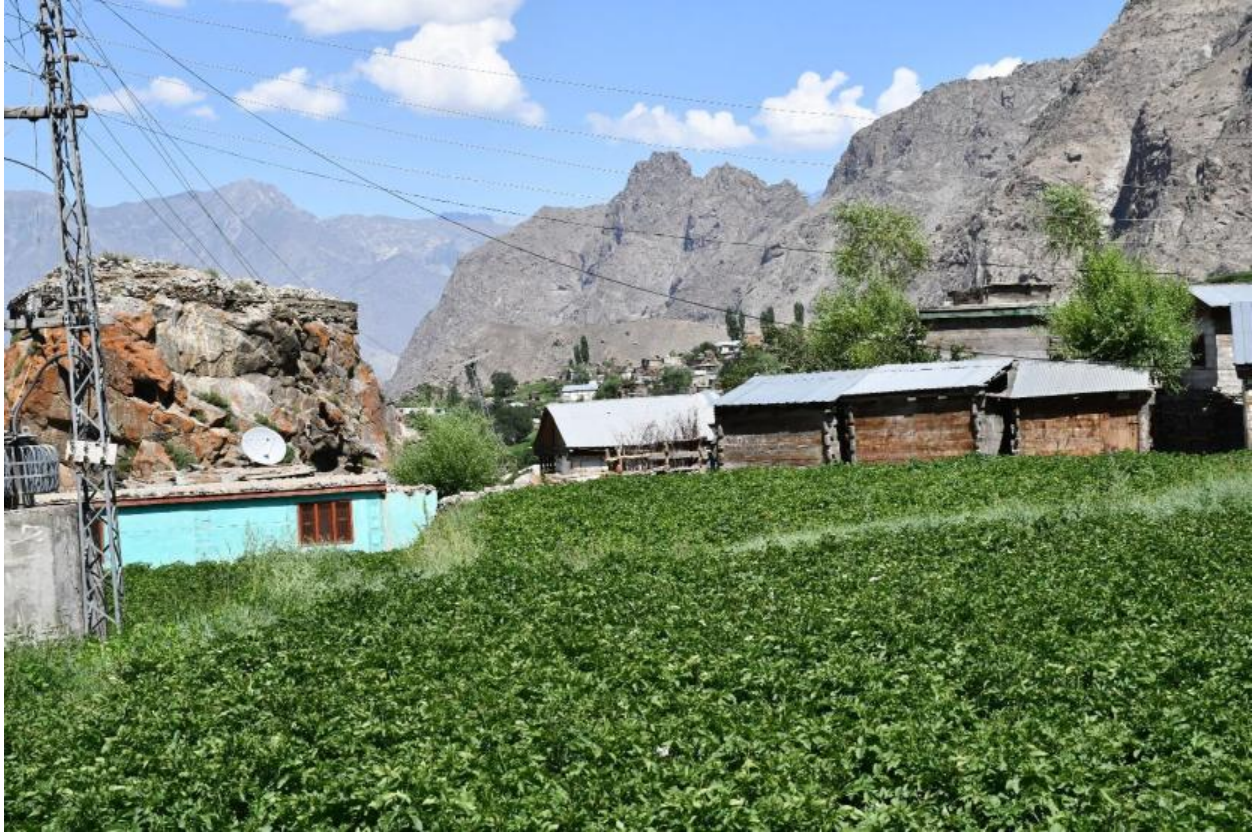
A series of wooden huts, houses in green fields neighboring the castle rock, roofs are covered with modern steel sheets now