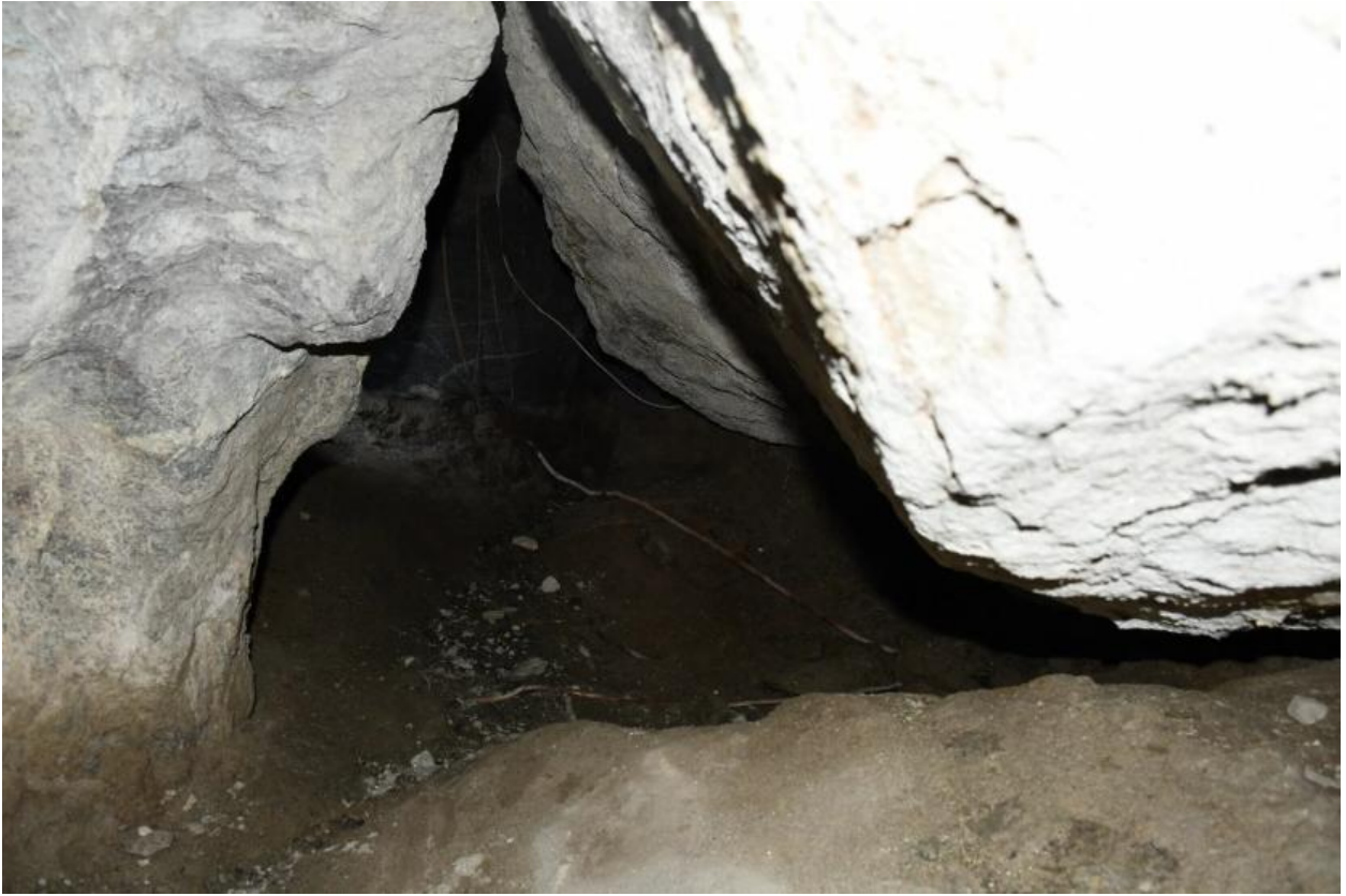
Outer entrance of the Cave